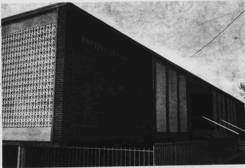
NEW BAPTIST STUDENT UNION BUILDING